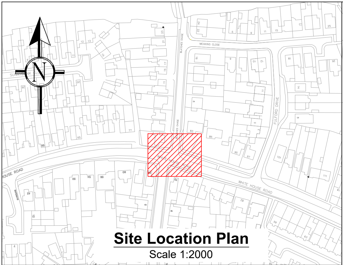
Site Location Plan Scale 1:2000