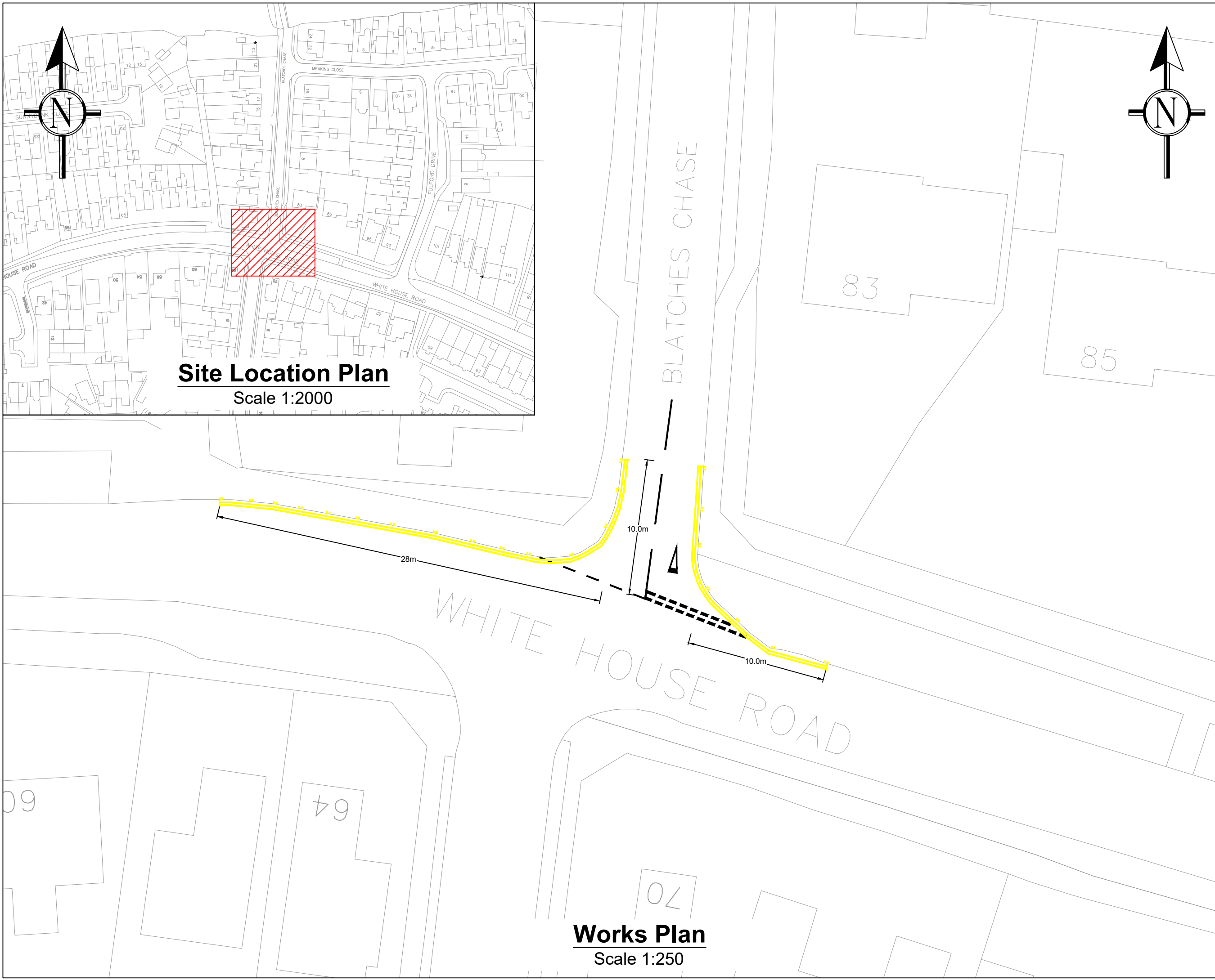
Works Plan Scale 1:250