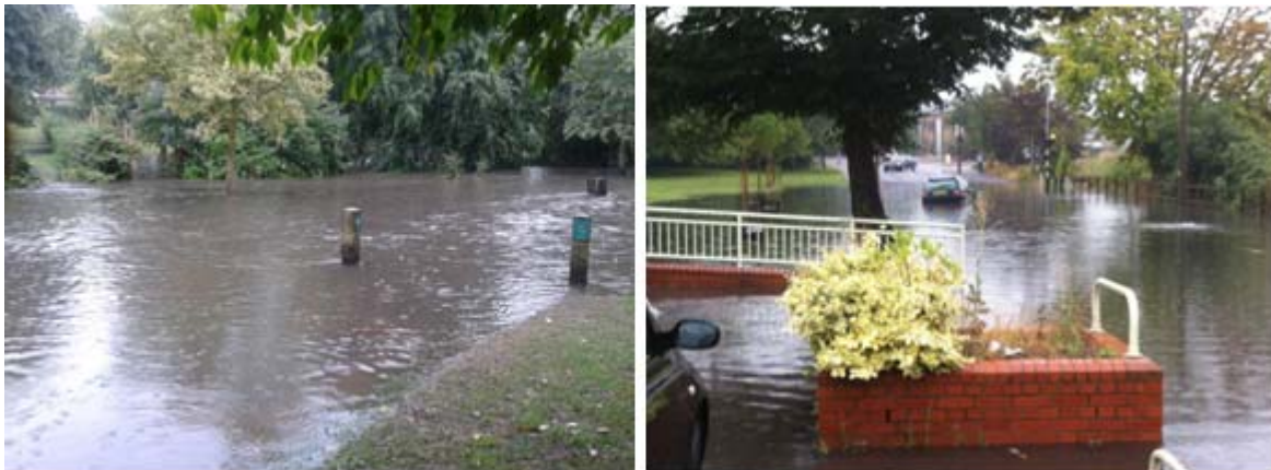
Figure 3: Combined sources of flooding within Southend

Current predictions of future rainfall indicate that we should expect increasing numbers of severe and extreme weather events in the future. Intense storms are the main cause of surface water flooding. It is predicted that the frequency of heavy rainfall events could double by the 2080s according to the UK Climate Projections 5 . Consequently, the number of properties, business and critical infrastructure at risk will increase.