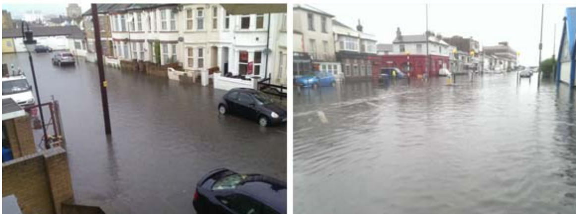
Figure 1: Flooding within Southend (August 2013)

It is not possible to prevent all forms of flooding; however, over time, Southend-on-Sea Borough Council will use this LFRMS, and future iterations, to increase our level of understanding of local flood risk posed to the community and to take the lead in effectively implementing measures to manage the risk where appropriate.