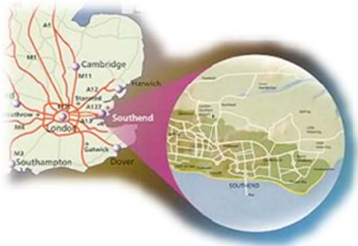
Figure 2.1: Southend-on-Sea’s location

2.13 Southend-on-Sea is a densely populated urban area covering 4,175 hectares (ha), which equates to almost 42 residents per ha. Its density is high compared with other unitary authorities such as Thurrock and Brighton (10 and 31 residents per ha respectively). The most densely populated parts of the Borough fall within the districts of Leigh and Westcliff and to the east of central Southend where densities can be as high as 145 residents per ha. This is shown in Figure 2.2.