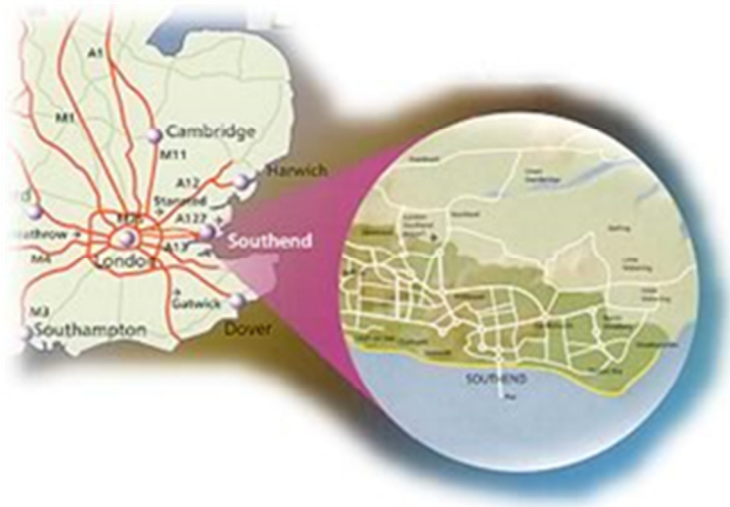
Figure 2.1: Southend-on-Sea’s location

2.13 Southend-on-Sea is a densely populated urban area covering 4,175 hectares (ha), which equates to almost 42 residents per ha. Its density is high compared with other unitary authorities such as Thurrock and Brighton (10 and 31 residents per ha respectively). The most densely populated parts of the Borough fall within the districts of Leigh and Westcliff and to the east of central Southend where densities can be as high as 145 residents per ha. This is shown in Figure 2.2.