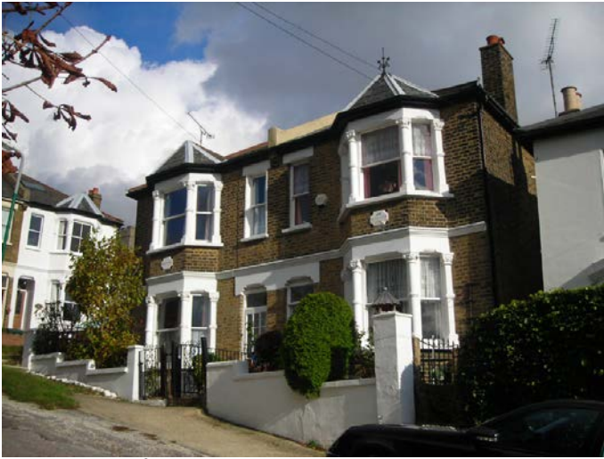
An example of late Victorian architecture in Leigh. This style can be found across the Borough.

31. The more industrial areas of the town are generally located to the north of the Borough along the A127 which is the designated freight route and around London Southend Airport. These are separated from the residential areas but play an important role in providing local employment for the Borough although a significant number of residents commute to London and other areas for work.