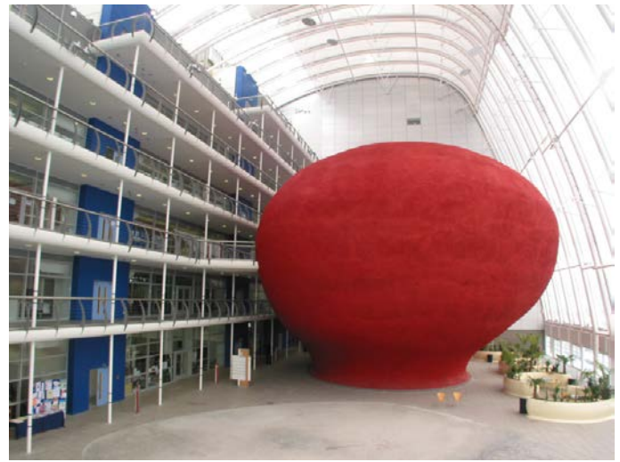
The atrium and pod of the South East Essex College provides a stimulating learning environment for students.

15. Southend Borough Council recognises that good urban design requires a 'partnership' approach between the planning authority and applicants for the benefit of the physical and built environment, the public and the local economy. This design guidance does not, therefore, prescribe specific solutions or set rigid or empirical design standards, but instead indicates options which emphasise and illustrate design objectives or principles. It is essential that applicants and their agents recognise the importance of, and adhere to, these objectives and principles in respect of all development.