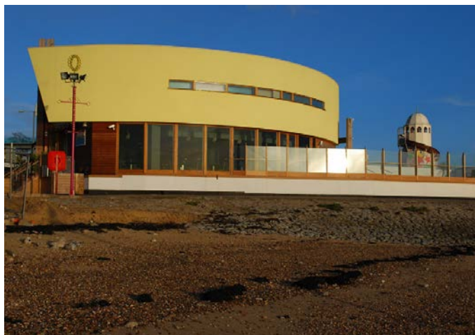
The Southend Radio station building forms a new vibrant landmark on the Seafront.