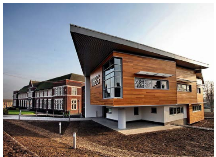
Extension to Westcliff High School for Girls contrasts effectively with the traditional school building.

11. To assist in the recognition and promotion of high quality design in the Borough, the Council operates a Design Award scheme every 1-2 years. It is open to all developments that have received planning permission in the previous five years and includes categories for both new build and conservation projects. This initiative has grown in stature over the years and an improvement in design quality through the Borough is evident and the Design and Townscape Guide is playing its part in raising the standard of entries for this scheme.