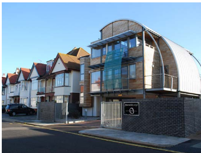
This dentist's surgery in Thorpe Bay has been deliberately designed to contrast the domestic architecture of the street.