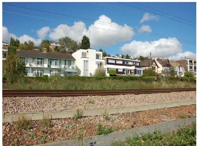
New Development in Undercliff Gardens makes the most of the estuary views.

3. ensuring design solutions that maximise the use of sustainable and renewable resources in the construction of development and resource and energy conservation (including water) in developments;