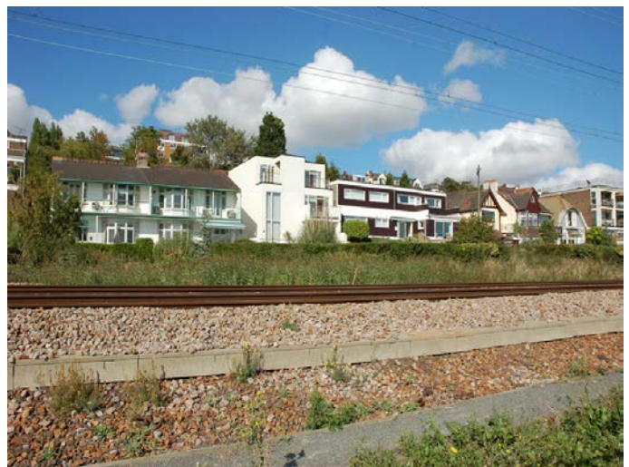
New Development in Undercliff Gardens makes the most of the estuary views.

3. ensuring design solutions that maximise the use of sustainable and renewable resources in the construction of development and resource and energy conservation (including water) in developments;