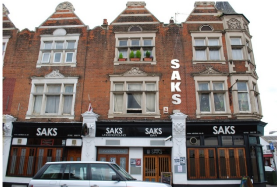
21-25 Clifftown Road. Terrace of 5 three storey red brick buildings with decorative

stone window surrounds and impressive Dutch gables. Number 21 on the corner has an integral turret feature which acts as a gateway to this part of Clifftown Road.