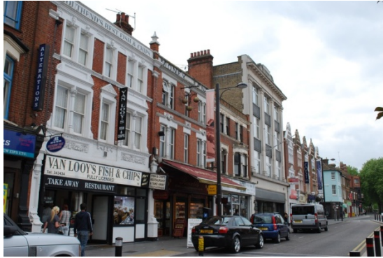
16-18 Clifftown Road. Terrace of 3 three storey red brick buildings with parapet roofs and decorative stone detailing built

around 1890. The plot widths are wider than other buildings in the street which add to their prominence. Each frontage has different window detailing but the banding and parapet detailing is consistent. 16 is most elaborate with elaborate stonework including a row of heads above the second floor windows.