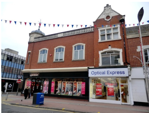
47 High Street. Coronation House 1911. Attractive three storey red brick building.

Decorative stone surrounds to window and front gable. Modern shopfront.