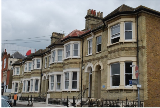
Late Victorian terrace of 6 cream coloured brick houses. Two and half

storeys with pitched slate roof, and part sunken basement. Steps to ground floor and well to front to give light to the basement. Three storey feature bay windows with stepped entrance to door and attractive curved porches. Decorative terracotta frieze above separating ground and first floors. Attractive and possibly original decorative railings to front are a positive feature in the streetscene. Remarkably intact.