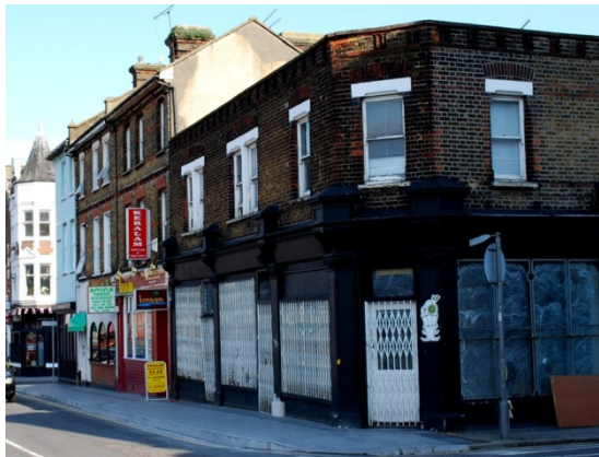
26-28 Clifftown Road. Terrace of 3 three storey buildings with simple sash windows to upper floors and pitched

roof. 27 and 27 retain their original stock brick with decorative terracotta banding but 26 has been painted light blue. All three have very poor shopfronts which detract from the overall subtle quality of the parent buildings.