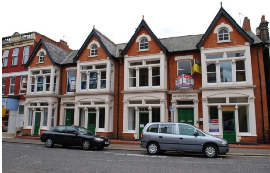
Weston Chambers. Pair of matching semi detached Edwardian buildings.

Built in red brick with slate roof and decorative stone surrounds to the windows including full height bays with gabled tops. Two full storeys with accommodation in the roofspace. Doors to centre of ground floor bays may have been a later addition but they do not detract from the historic character of the building. Many original features remain including most sash windows and main front doors.